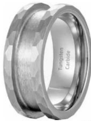
Hammered Tungsten Ring Blank