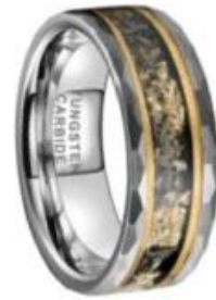
Inlay Dinosaur Bone