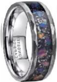
Inlay Metal Chip