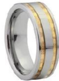
Inlay Carbon Fiber