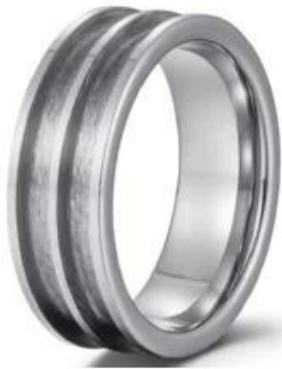
Dual Channel Tungsten Ring Blank