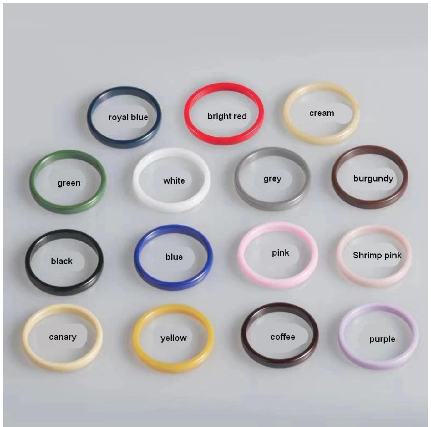
Semi-finished Ceramic Rings: Ceramic rings with groove, ceramic rings with hole. Ceramic rings can be inlaid with carbon fiber, shell, dragon steel, resin, meteorite, wood, opal, turquoise etc.