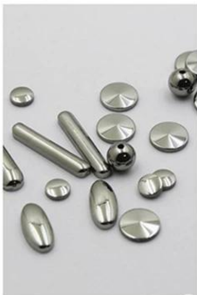
99. 9998% Germanium