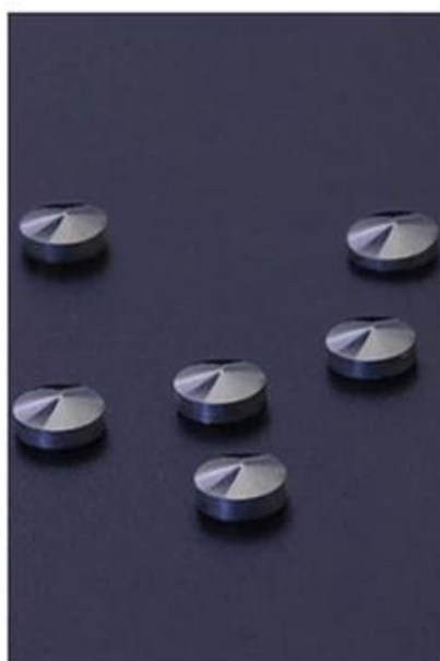
Light Wave Stone